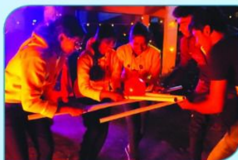
English Dept. Tour