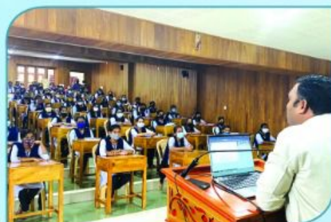
Computer Science Dept. Seminar