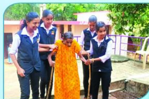
Commerce Old age Home Visit