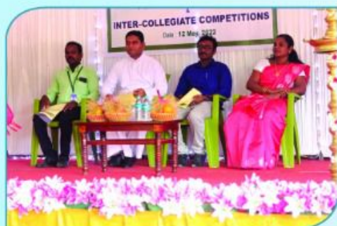
Maths Dept. International Seminar