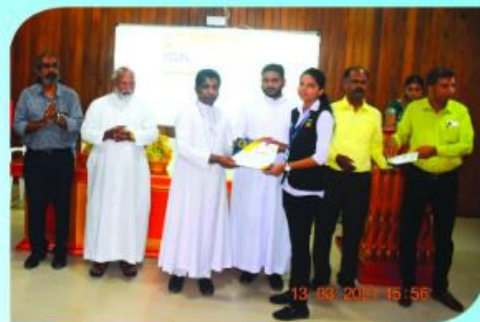
Chemistry & Physics Dept. Seminar